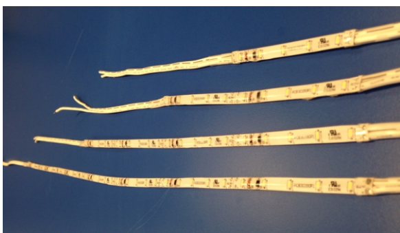
Wires Attached to both end of each Circuit Segment